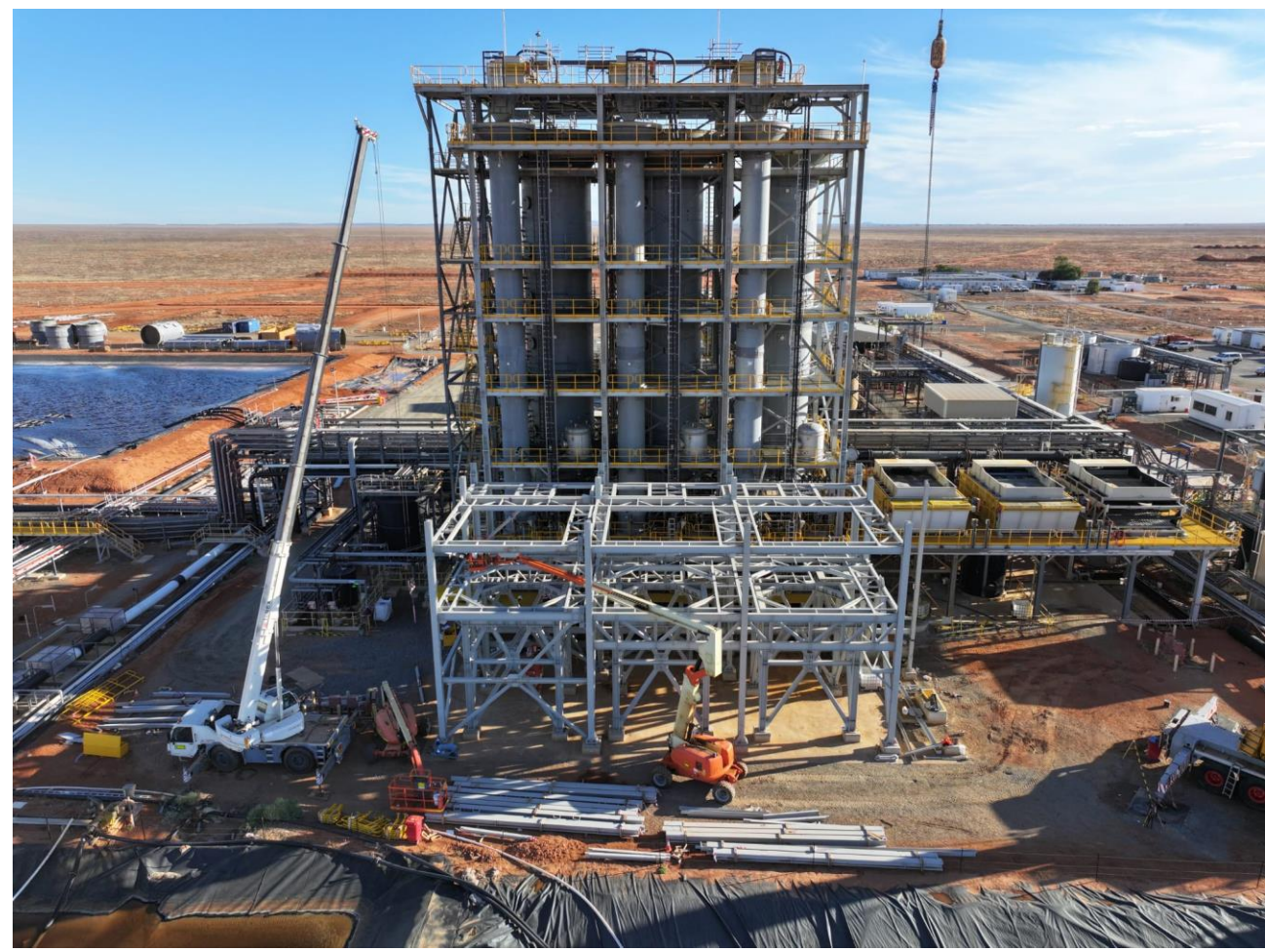
Figure 1: Steelwork foundations installed for construction of NIMCIX columns 4 to 6