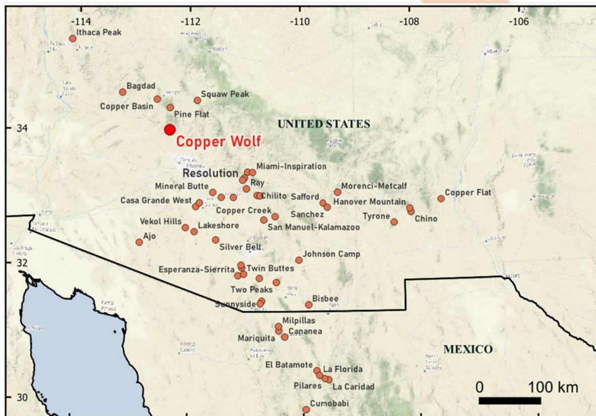
Figure 2: Buxton's Copper Wolf project is located in the prolific porphyry copper belt of SW USA / Northern Mexico - most of the porphyry Cu-Mo deposits marked are current or historical mines.