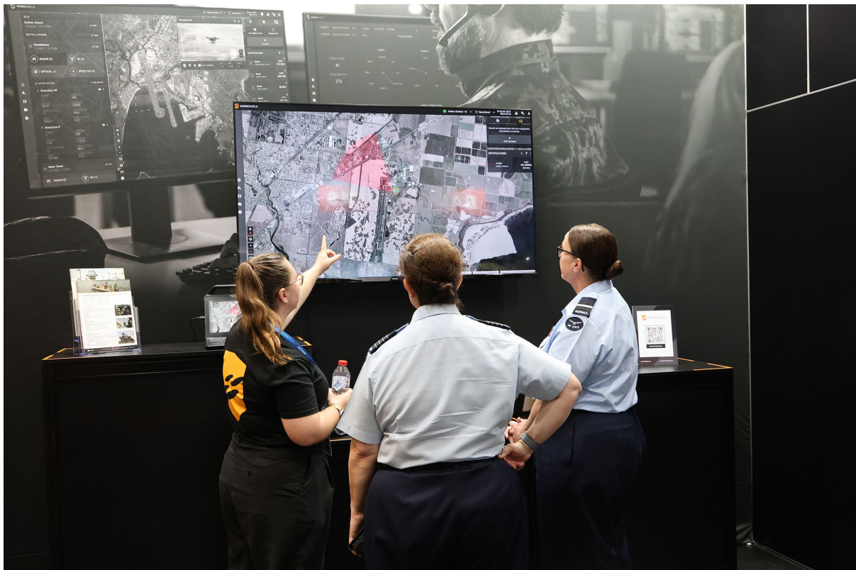
Image: DroneShield DroneSentry-C2 command and control system displayed at Avalon Airshow

DroneShield Limited (ASX:DRO) (DroneShield or the Company) is pleased to announce it has received a package of five separate contracts totalling $32.2 million from an in-country reseller for delivery to a military end customer in an Asian Pacific country. The reseller is a wholly-owned subsidiary of a multi-billion dollar, global, publicly listed customer that is contractually required to distribute the products to a major Asia Pacific military government department. The systems are for both vehicle-mounted and fixed Counter-UxS (counterdrone) systems. DroneShield expects to deliver all equipment and receive payment through Q2 and Q3 2025. No additional material conditions need to be satisfied.