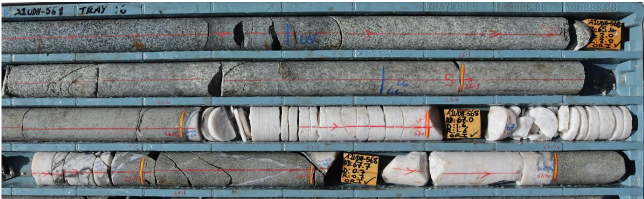
Figure 3: Drillhole A1UDH-568 showing a quartz intercept

Hole A1UDH-568 was targeting the Bass Reef and parallel structures and/or potential orthogonal structures within the diorite dyke. One significant quartz structure was identified (Figure 3). Both contacts are significantly stylolitic but no visible gold was noted.