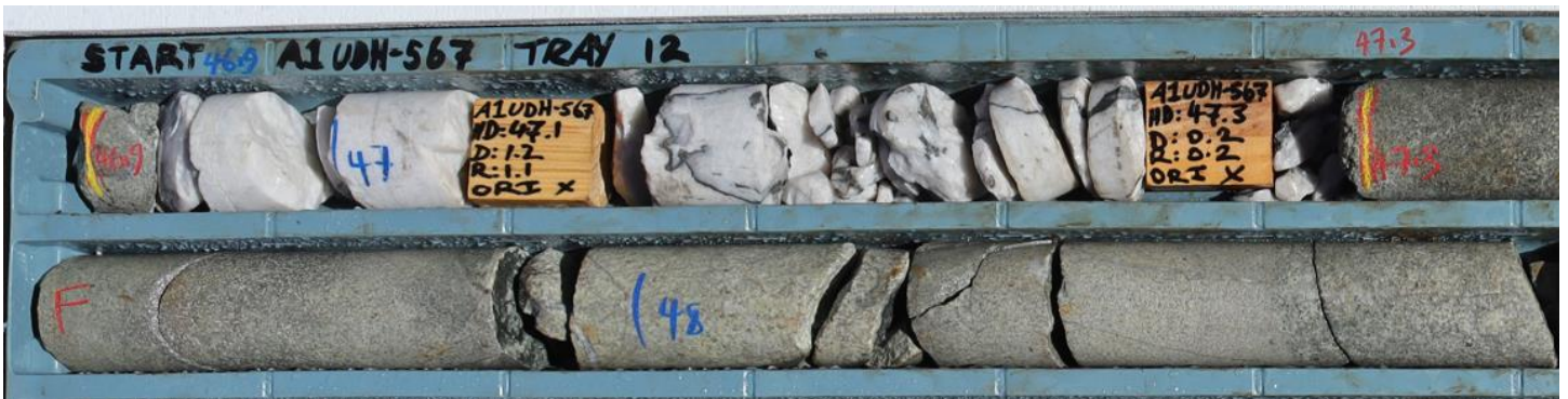
Figure 2: Drillhole A1UDH-567 showing the second mineralised intercept

The second mineralised vein included several greasy, erratic sulphidic-stylolitic veinlets and was encountered from 46.9-47.3m (Figure 2).