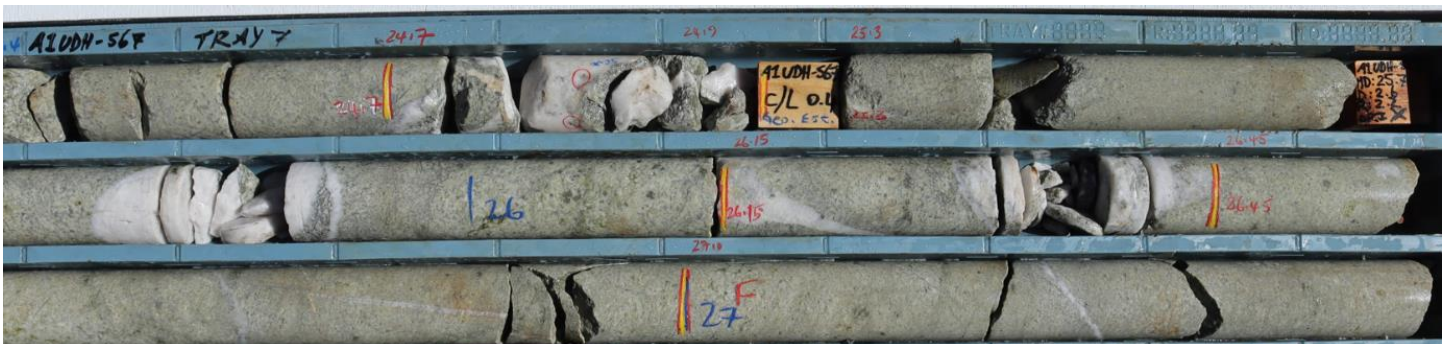
Figure 1: Drillhole A1UDH-567 showing the first mineralised intercept

Visible gold was noted in the brecciated quartz and moderately altered dyke from 24.7-24.9m. Unfortunately, 0.4m of core was lost during this drilling (Figure 1). The lost core may be underreporting the width and grade of this intercept.