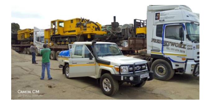
Figures 6 and 7. Equity Drilling AC/RC drill rig and equipment transportation and mobilization