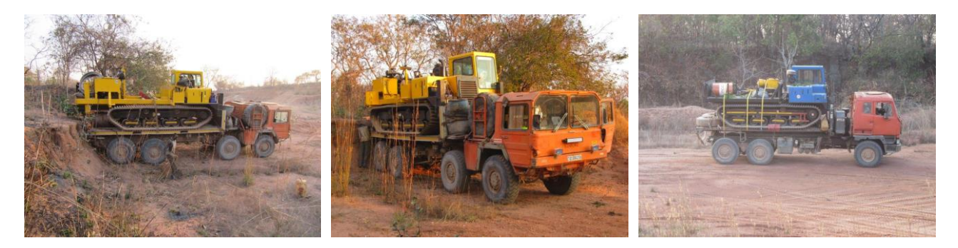
Figures 10, 11 and 12. Equity Drilling AC/RC drill rig and equipment on site at Kanuka Lithium Production Project

Equity Drilling will now complete an initial 3,000m AC/RC program which will be principally focused in the current main mining pit of the operations of MMR and where a major pegmatite body, the Kania Main Pegmatite, has been exposed from mining activities.