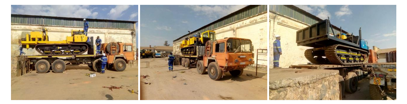
Figures 4 and 5. Preparation of the Equity Drilling AC/RC drill rig and equipment for transportation and mobilization

Equity Drilling Limited ( Equity Drilling ), who were appointed as the Company's drilling contractor in late March 2018 (refer ASX Announcement dated 28 March 2018) has completed mobilisation of the AC/RC drill rig and associated equipment to the Company's exploration camp at the Kanuka Lithium Production Project.