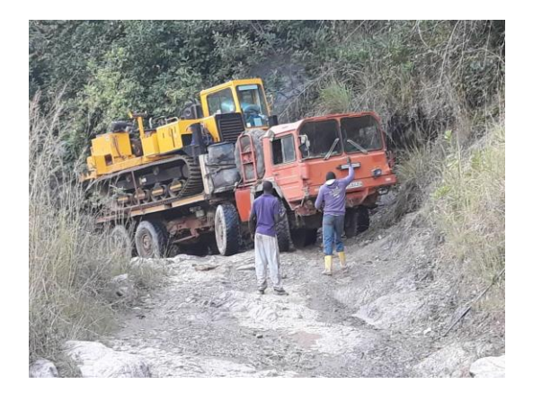
Figures 8 and 9. Equity Drilling AC/RC drill rig and equipment transportation and mobilization to Kanuka

Equity Drilling will now complete an initial 3,000m AC/RC program which will be principally focused in the current main mining pit of the operations of MMR and where a major pegmatite body, the Kania Main Pegmatite, has been exposed from mining activities.