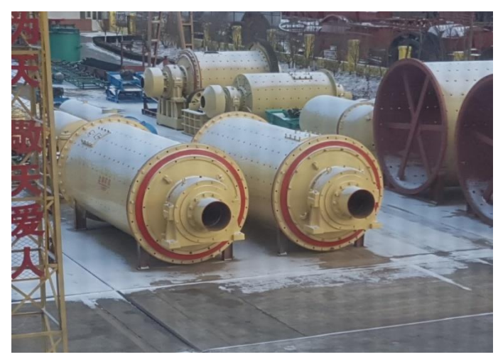
Image 1. Lindi Jumbo mills in storage at Jinpeng Mining and Machinery in Yantai, China.

• Final transactional approval completed in Northern Ireland with field exploration underway.